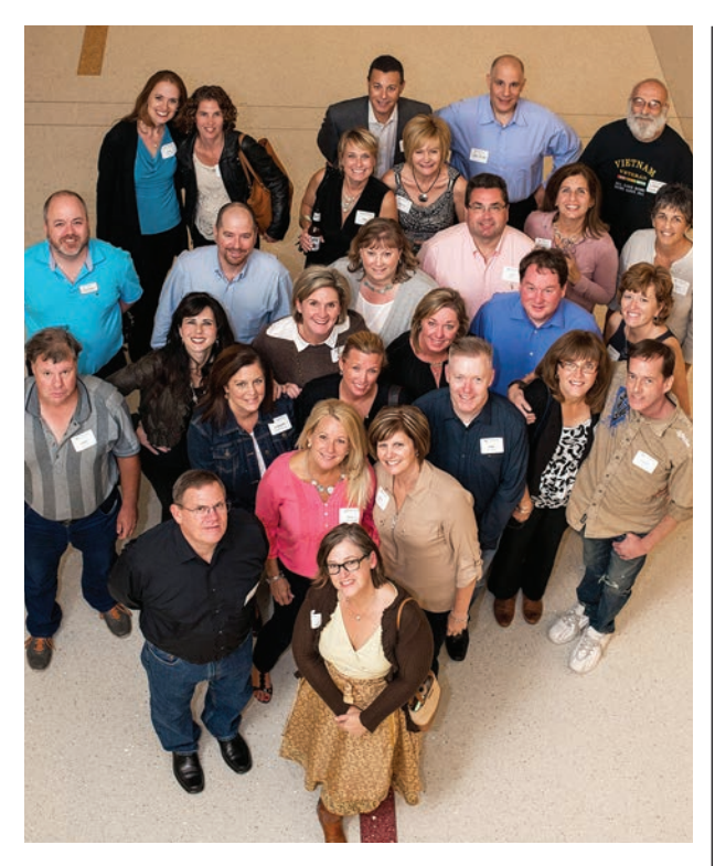
The Class of 1990 held their 25th Reunion on September 26, 2015 in the old student center pub. now called the Falcon Hub.