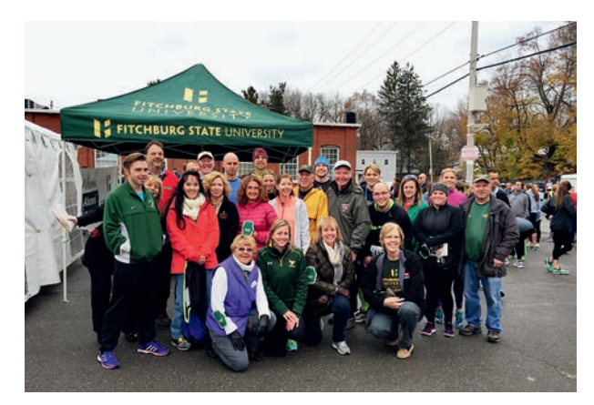
This year the Alumni Association joined in celebrating the 35th Slattery's Turkey Trot in November. Ninety alumni runners and spectators stopped by the alumni tent for a gift and to be entered into the free raffle.