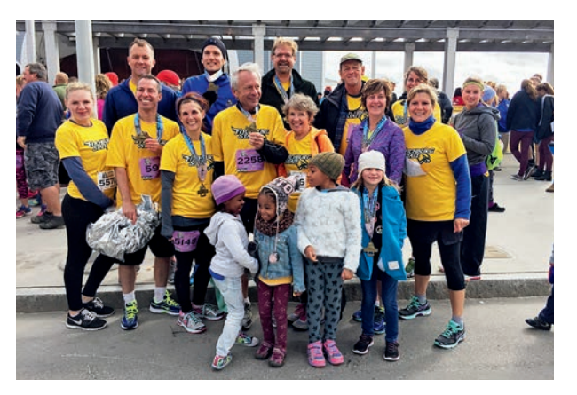
Thirteen Fitchburg State faculty, staff and alumni ran in the Smuttynose Rockfest Half Marathon & 5K, in Hampton, New Hampshire, in October.