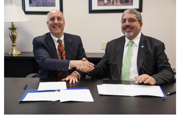
President Lapidus with QCC President Luis Pedraja

The agreement provides guaranteed acceptance into the deaf studies and American Sign Language baccalaureate programs at Fitchburg State as long as all criteria are met. Students must meet GPA requirements specified in the agreement, and follow the transfer admissions process for Fitchburg State.