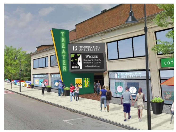
An artist rendering of the renovated theater block.