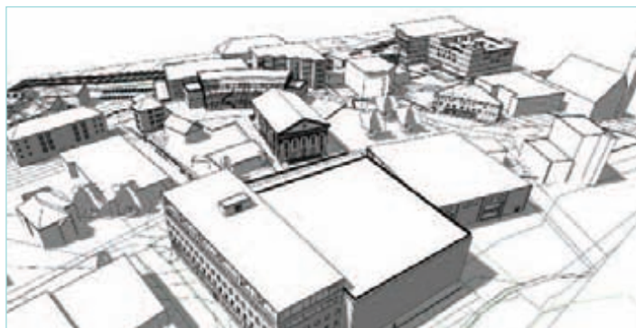
Architecture students envisioned a new downtown corridor.