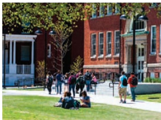
The new plaza in front of Edgerly Hall quickly became a gathering spot for students.