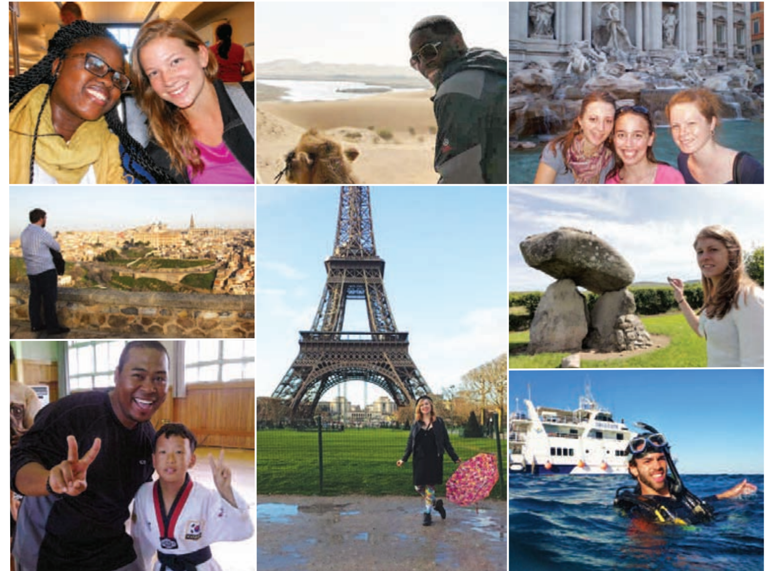
Fitchburg State students take their studies across the globe, led by university faculty or through programs approved by the campus.