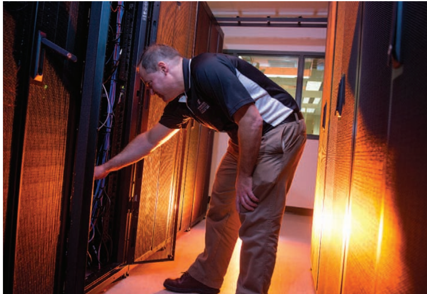
The heart of the university’s wireless network is in the Information Technology portion of Conlon Hall.