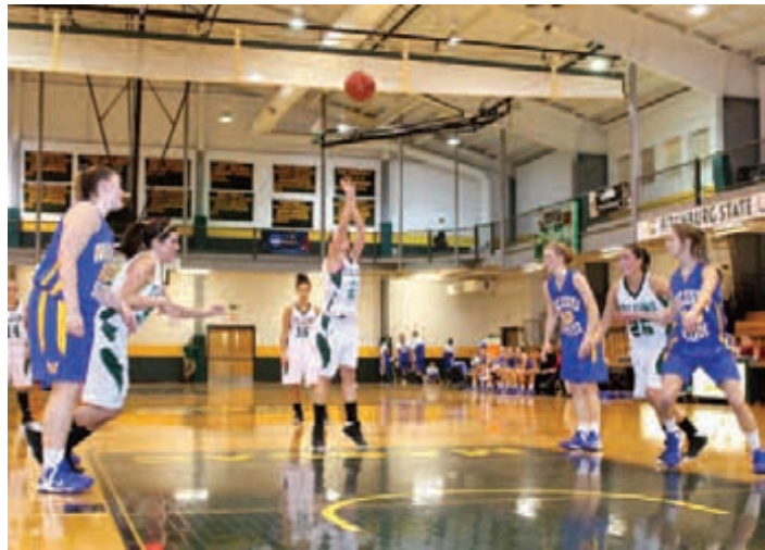
The women’s basketball team has played in the NCAA tournament during its storied run over the past 10 years.

After winning the MASCAC title, the Falcons were awarded an automatic berth in the NCAA Division III tournament. The Falcons lost in first round to the University of Rochester, 91-86, but it was an experience the players and coaching staff will never forget.