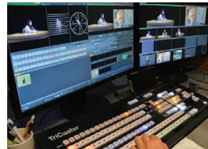
Students learned multi-camera television production at FATV's state of the art studio.