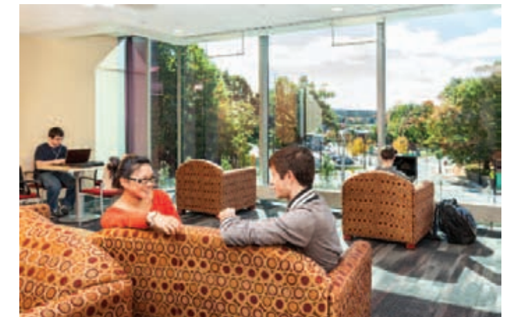
The renovated Hammond Hall is a prime spot for studying and relaxation. Its open design and abundant glass reinforce a welcoming environment.

The university boasts a wide slate of commuter-directed programs and spaces within the campus center. The new commuter lounge is always abuzz with activity and the new game room—featuring pool tables, board games and televisions—is more centrally located, providing students with a prime location to relax. Several lounge spaces allow students ample opportunities to gather in small groups or study quietly in bright, welcoming environments. And the Hammond Hall Art Gallery has been completely renovated, yielding yet another opportunity for cultural enrichment for the building's thousands of visitors.