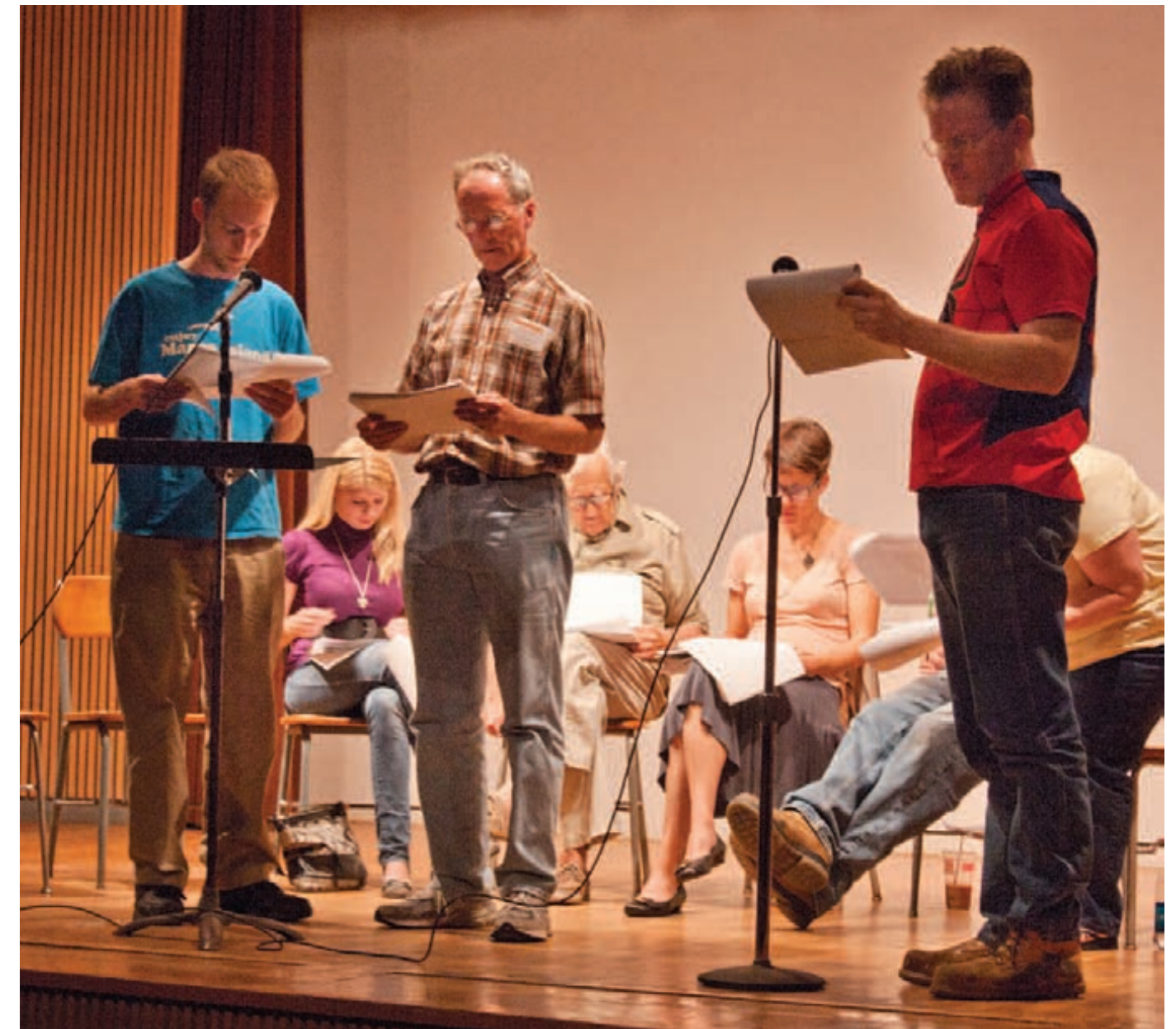
A community read-aloud of Ray Bradbury's Fahrenheit 451 was part of the month-long celebration of the novel's 60th anniversary. The events comprised a wide-ranging discussion of issues related to censorship, book-burning and free expression.