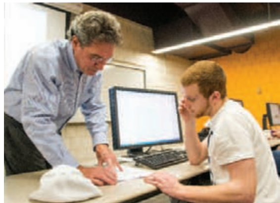
Renovations to Conlon Hall have created new lab space.