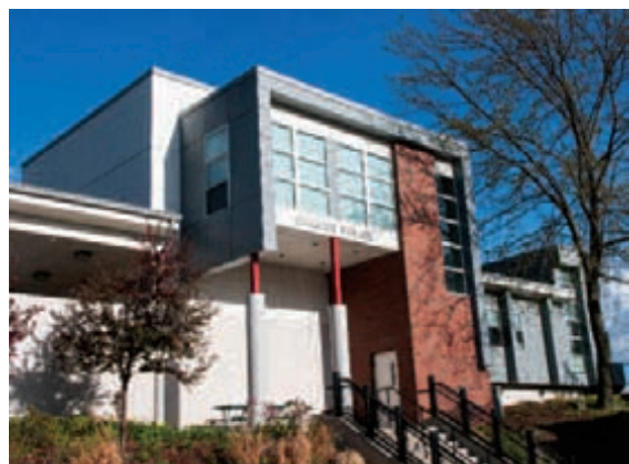
The Campus Police station, built between Clinton and North streets, has improved safety for the university and the neighborhood.