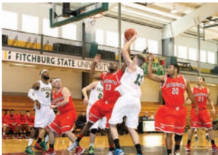
The men's basketball team went to the NCAA Tournament in 2013.

Fitchburg product Trevor Lawler took a feed from Cory Callen and potted the game-winning goal 1:08 into OT to spark a wild celebration.