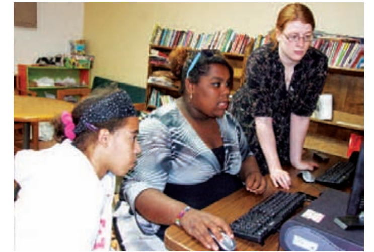
The University Project brought students into the city as tutors and mentors.