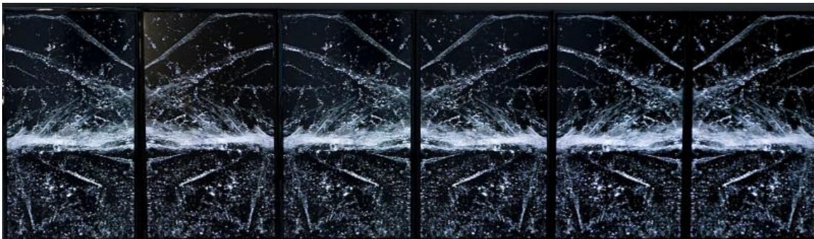
"Black Ice" by Madeleine Altmann.

The sculptural video installations of artist Madeleine Altmann are on display in gallery spaces at Fitchburg State through Wednesday, Feb. 22 as part of the CenterStage arts and culture series.