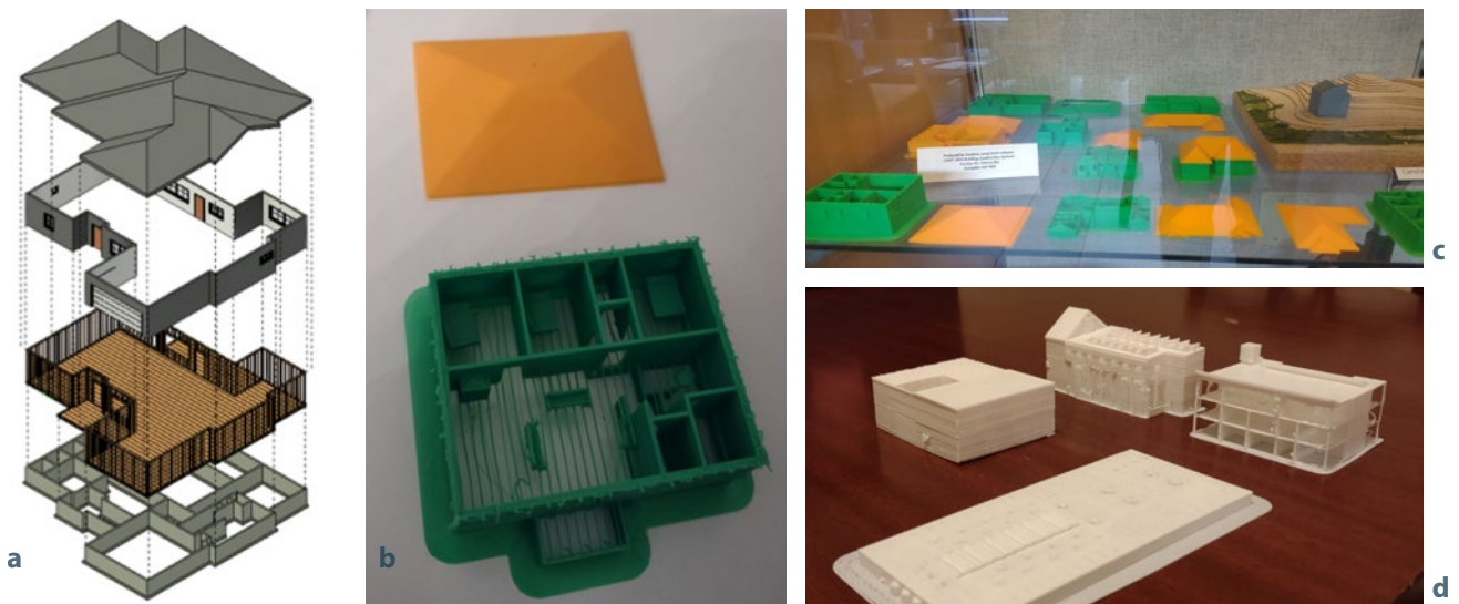
Figure 2: a) Cascade of residential building; b&c) 3D printed models of residential buildings; d) 3D printed models of Sustainable Office Buildings