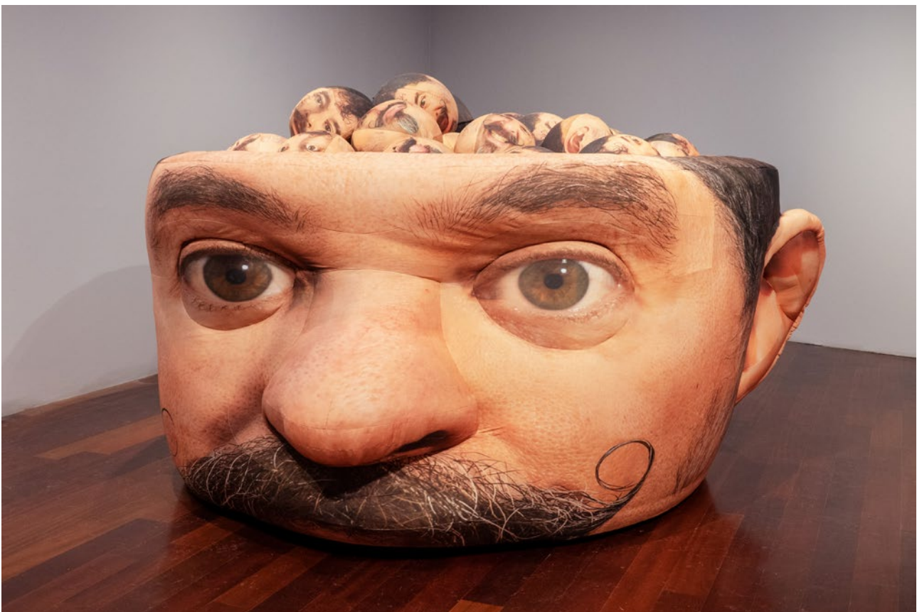
CAPTION: Urgent Blowout , inflatable fabric sculpture with 36 inflatable heads, 10 feet wide, installed at Boston Sculptors Gallery, 2019