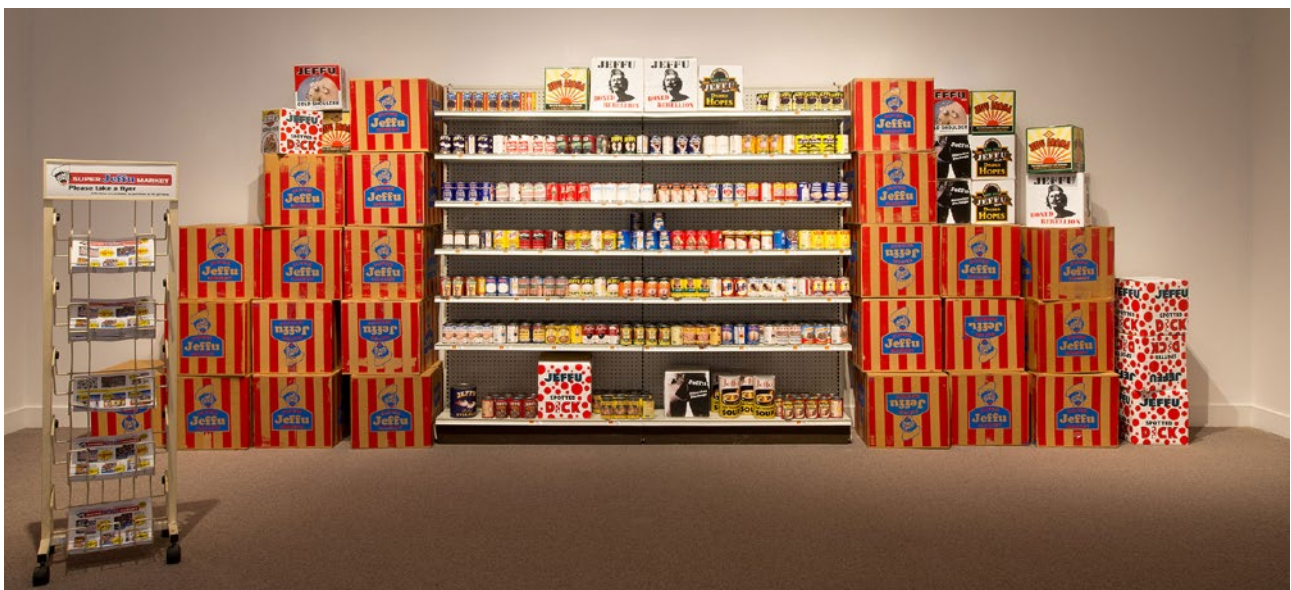
CAPTION: SuperJEFFUMarket installation (steel shelves, aluminum cans with custom labels, silkscreened cardboard boxes) installed at Fitchburg Art Museum for the exhibition Jeffu Warmouth: NO MORE FUNNY STUFF, 2014.