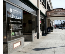
PARKING IN REAR OF IDEALAB BY TURNING ONTO CENTRAL STREET